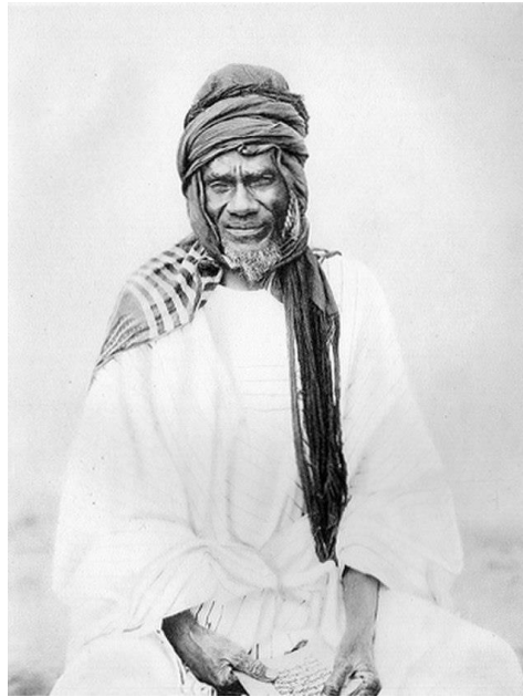
Figure 3: Samori Toure (1828-1898), ruler of the Mandinke empire in western Africa