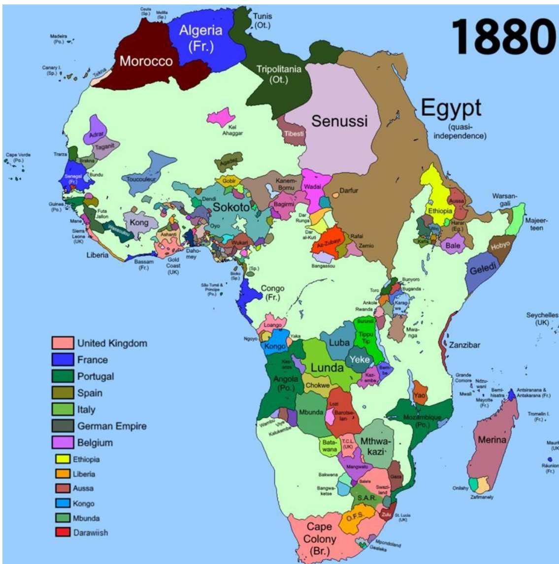
Map 2: Political entities prior to the partitioning in 1880