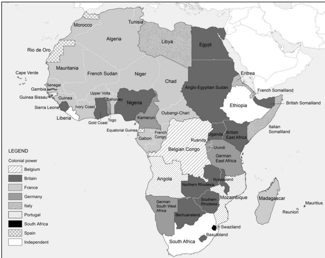
Map 3: Africa in 1914