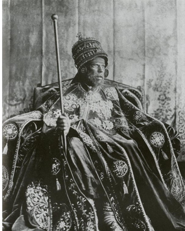
Figure 2: Emperor Menelik II of Ethiopia (1844-1913)