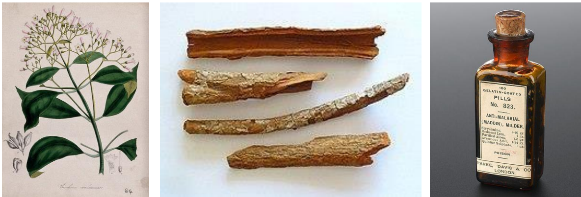
Figure 1: Quinine extracted from the bark of the cinchona tree